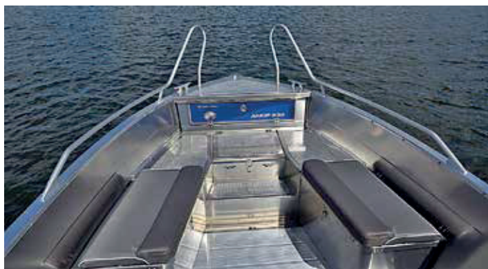
Standard-setting step up to the bow deck. Both of the front cockpit's benches are also shown here.