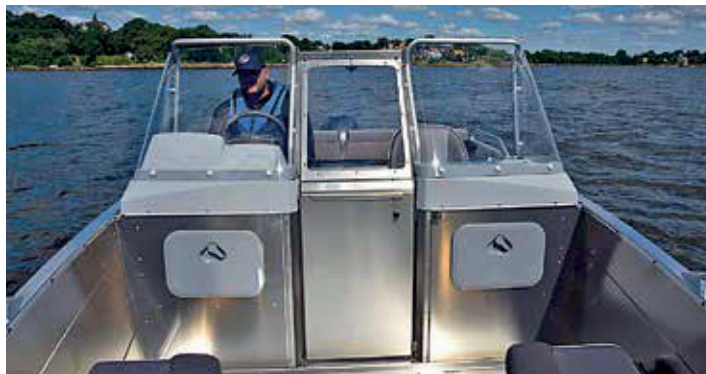
On this model, the upper part of the door slides into the lower. Linder has fitted two clever stowage compartments in the console fronts.