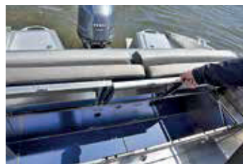
Stern compartment with three separate hatches that enable easier access without everyone having to stand.

Standard equipment: Anchor locker, bathing ladder, fire extinguisher, seat pads for rear cockpit, cover, 9-inch map plotter with sonar, navigation lights, mooring eye, bilge pump, hydraulic steering, etc.