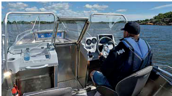
Visibility and driving position are excellent in the new Linder Arkip 530. A 9-inch map plotter with sonar comes as standard.

IN SUMMARY , a highly successful, new design with plenty of clever and elegant details and comprehensive standard equipment. Furthermore, it cuts effortlessly through the water and feels unusually “grown up” for a boat in the 5.3-metre class. Last but not least, Linder has succeeded in greatly reducing noise in the important operating speed range of 20 to 30 knots. This is not always so easy in an aluminium boat! ■