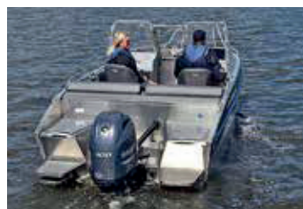
Designed just as cleverly as the bow end of the boat, the stern has large platforms (and stowage compartments) on each side of the motor. Lower down, there are also a couple of bathing platforms.